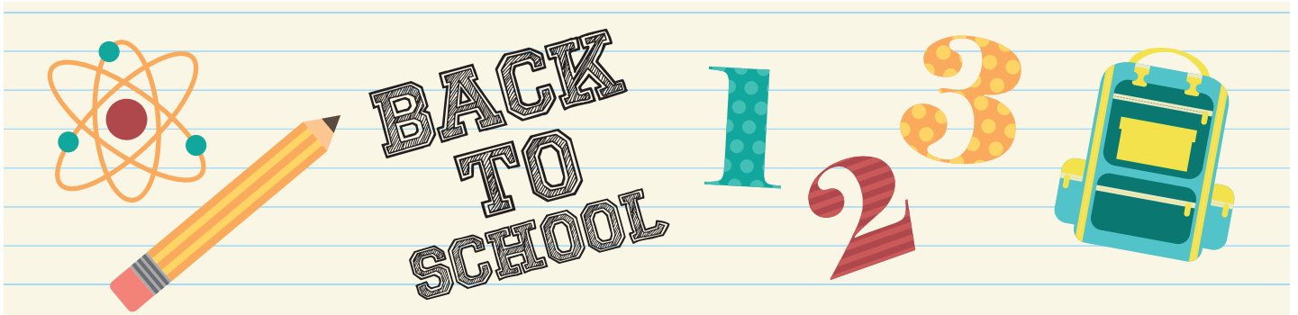
Quantity needed per grade per student

OR opt to pay Supply Fee of $25.00 for the entire year ($12.50 per semester)